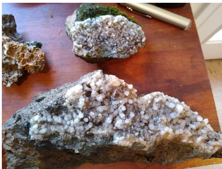
Quartz finds from the Charlottesville, Virginia area