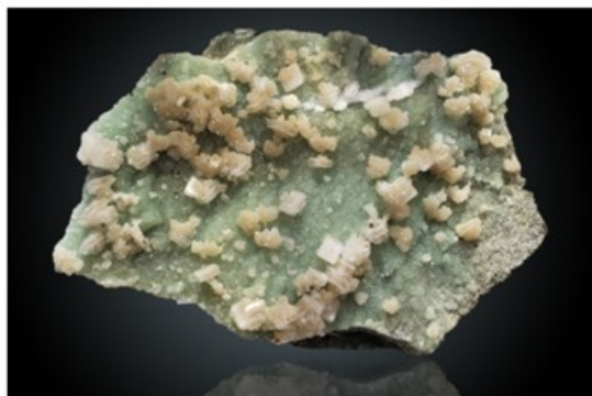
Apophyllite, Prehnite & Chalcophyllite

The VMP will start off March organizing data collected in Feb. and making the final club introduction presentation to the Virginia Peninsula club in Hampton. From there, the VMP will then be a part of the Montgomery Show in Maryland, staying the entire time and running an educational booth and setting up a display of Virginia minerals! The Maryland trip will be vital in meeting with collectors in the state who have had a history of coming to the Northern quarries and collecting specimens over the years. The VMP plans to collect data and view collections for three days after the show and will then end with a presentation to the Southern Maryland Club. Presentations are also planned with the Farmville-Prince Edward Historical Society, Richmond Club, and Richmond Master Naturalist Clubs. The month will finish with a presentation at the Eastern Federation Banquet during the Catawba show!